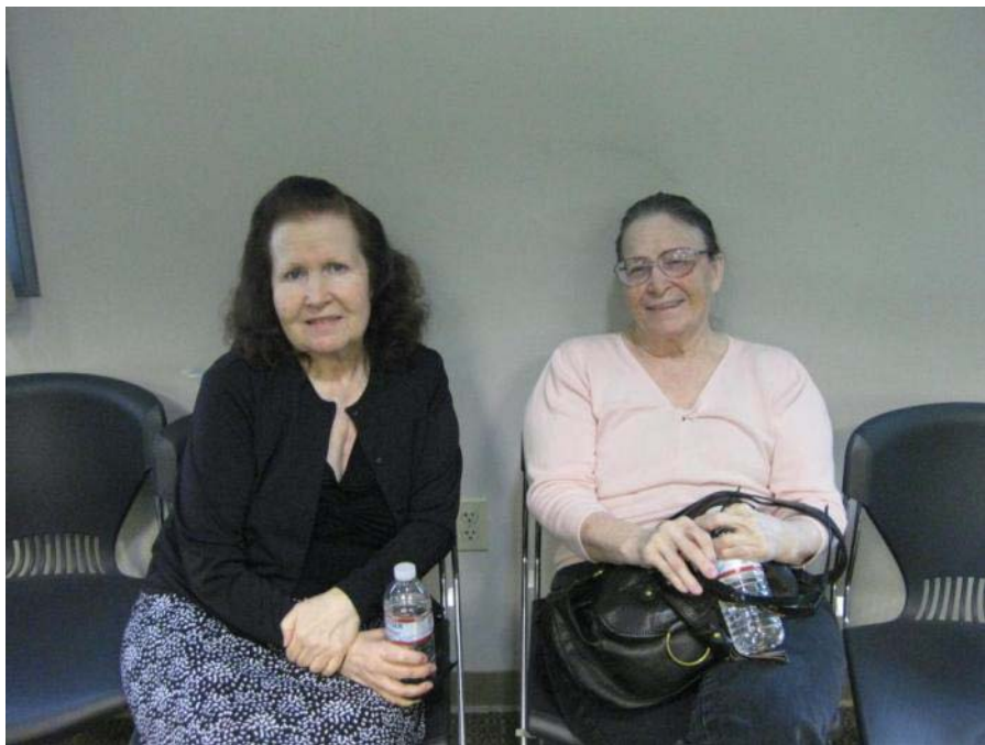
Awards event guests