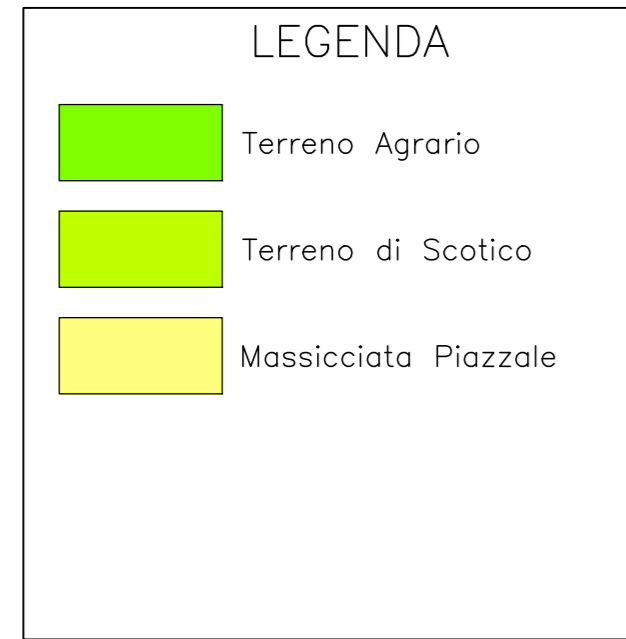
SEZIONI Scala 1:1.000